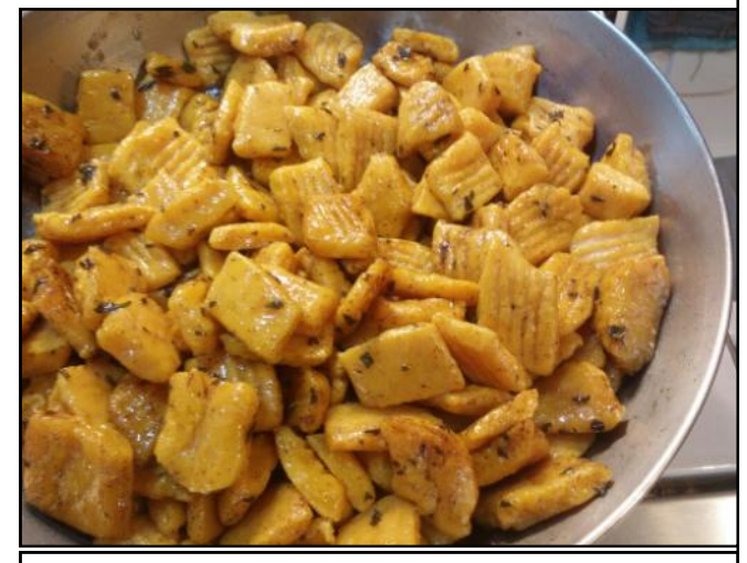
Gnocchi made by farmer Steve. This recipe is fabulous! Well worth the time and effort.

Preheat oven to 400°F. Cut squash lengthwise in half; discard seeds. Place squash halves, cut side up, on baking sheet and brush with oil. Roast until squash is very tender when pierced with skewer and browned in spots, about 1 1/2 hours. Cool slightly. Scoop flesh from squash into processor; puree until smooth. Transfer to medium saucepan; stir constantly over medium heat until juices evaporate and puree thickens, about 5 minutes. Cool. Measure 1 cup (packed) squash puree (reserve remaining squash for another use).