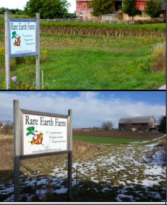
Let the memories of your summer keep you warm throughout the winter.

https://www.youtube.com/watch?v=zXRNF_1X2fU