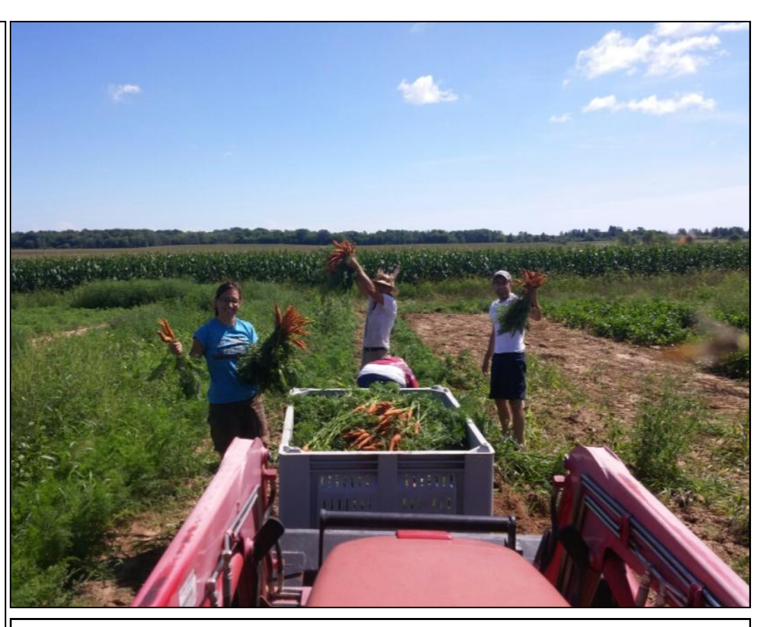
Work share volunteers gathering carrots for today's delivery.

Boil carrots in a large pot of water until tender about 7-9 mins. Strain carrots and mix with the remaining ingredients. Adjust as needed according to your taste. Taste and add more thyme or vinegar as needed.